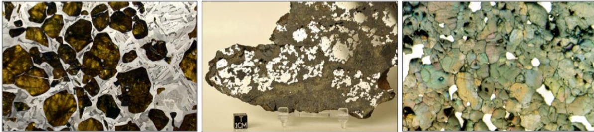
Figure 3: Left: Fukang pallasite, showing cm-sized olivine ( \text{Mg-Fe}_2\text{SiO}_4 ) crystals embedded in a metallic Fe-Ni matrix (taenite and kamacite) © 2015 Southwest Meteorite Laboratory. Center: Estherville mesosiderite © Collecting Meteorites. Interconnected metal network (white) in the silicate portion. Right: Lodranite NWA 5210. Notice Fe-Ni metal blebs (white) at olivine and pyroxene grain boundaries. Combination of transmitted and reflected light. Total length is 7 mm. © T. E. Bunch, 2009. Notice the significant changes in metal/silicate modal abundances through these 3 examples.

building blocks of a differentiated body, which otherwise could not be seen, in the hope of doing fundamental advances in understanding planetary formation and interiors.