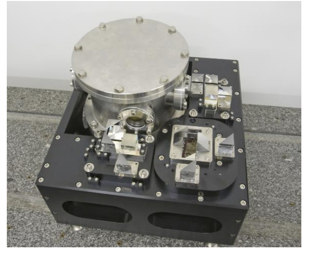
Figure 2. View of the DSI instrument during integration phase. The Mach-Zehnder is inside the vacuum chamber on the left. The two output beams are splitted by polarizer cubes and folded onto the detector, that will take place above the mirrors, on the right.

Guiding effects and atmospheric turbulence are important sources of uncertainties in the velocity field measurements, mainly because of the fast Jovian rotation of 12 km/s at the equator (and similar value on Saturn). This fast rotation is the cause of a spurious velocity signal associated with the displacement of the planet image in the field of the instrument. Moreover, fast atmospheric agitation as well