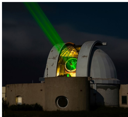
The MéO telescope in action